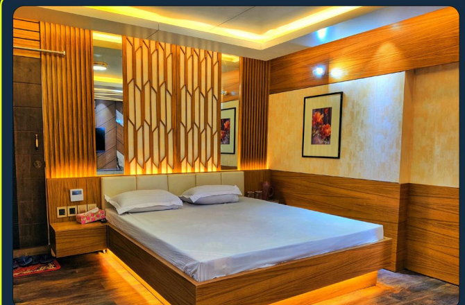
VIP Premium Class