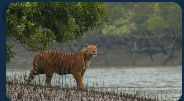
Royal Bengal Tiger

T&C : As per Company Policies Per Person. 5% GST & Visa Fees Extra.