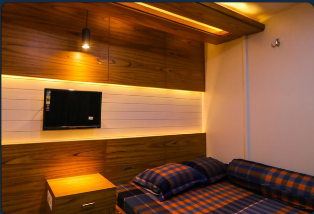
Family Cabin Twin Sharing