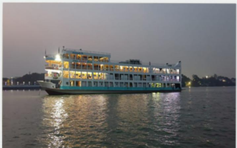
M.V. Razarhat C