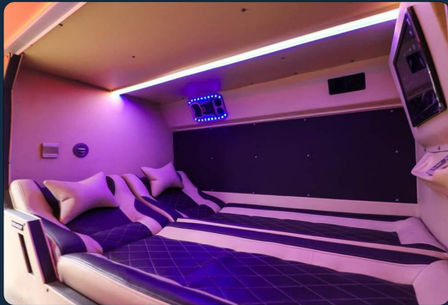
Double Sleeper Bed Sharing